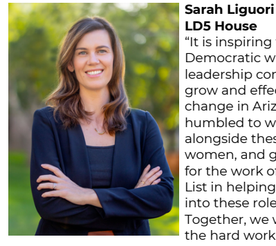
LD5 House "It is inspiring to see Democratic women leadership continue to grow and effectuate change in Arizona. I am humbled to work alongside these smart women, and grateful for the work of Arizona List in helping us step into these roles. Together, we will do the hard work."